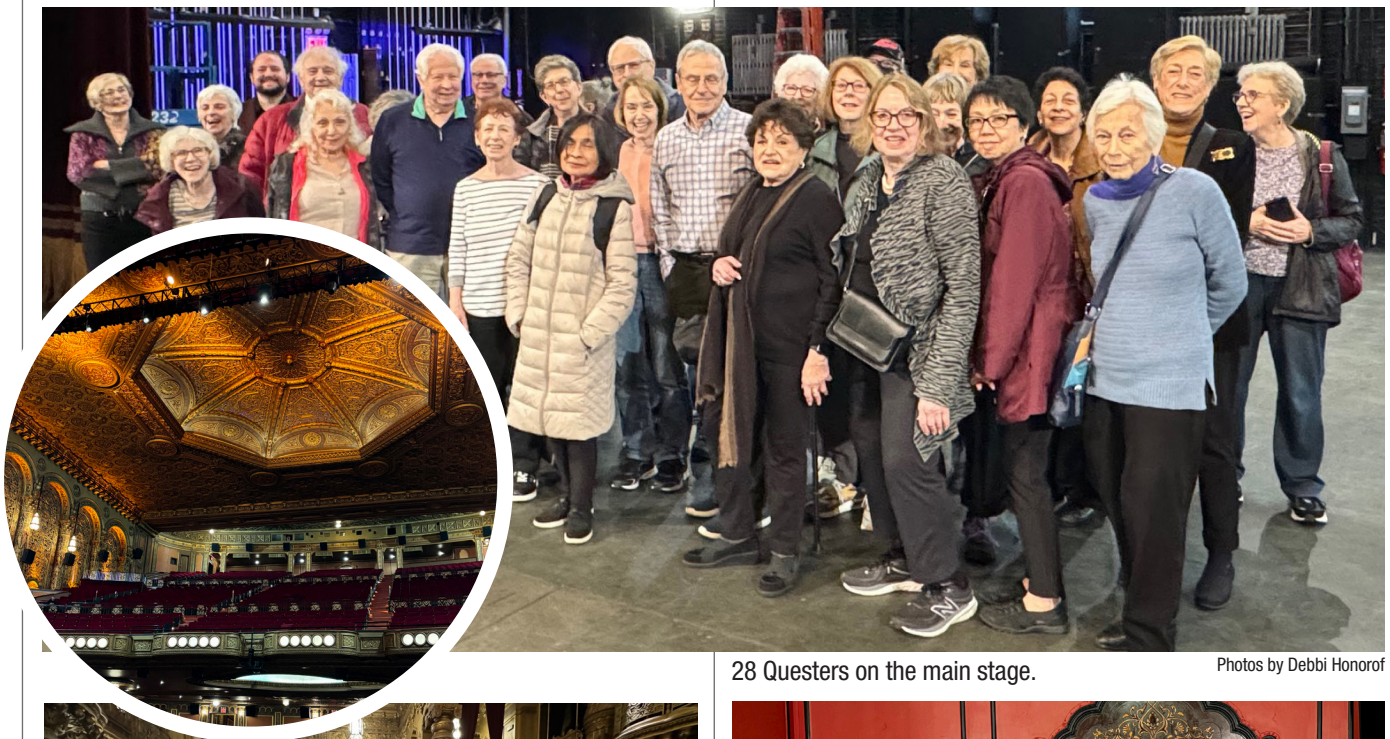
28 Questers on the main stage.

As we crossed Broadway heading for Malecon, we were in a joyous mood. We were seated at small tables of four conducive to conversation, sharing unfamiliar dishes, and grand camaraderie. It was clearly another "Quest" success!