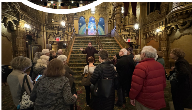
Inside Grand Lobby listening to our guide