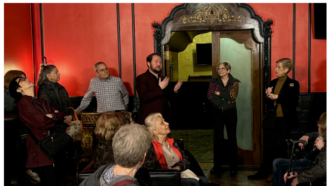
The former smoking room for the "men."