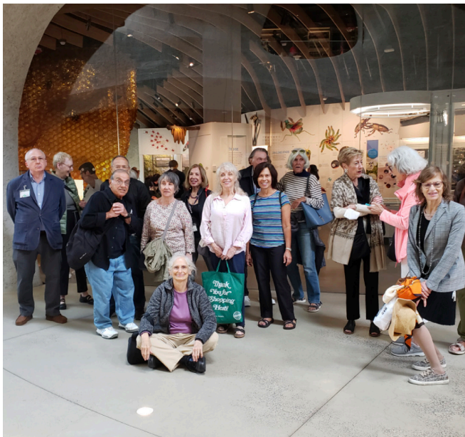
Oops. We omitted this photo of the CultureQuest tour of the Insectorium at American Museum of Natural History on September 15.