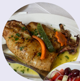
Tender grilled squid