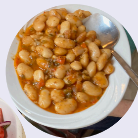
Gigantes... melt in your mouth giant butter beans