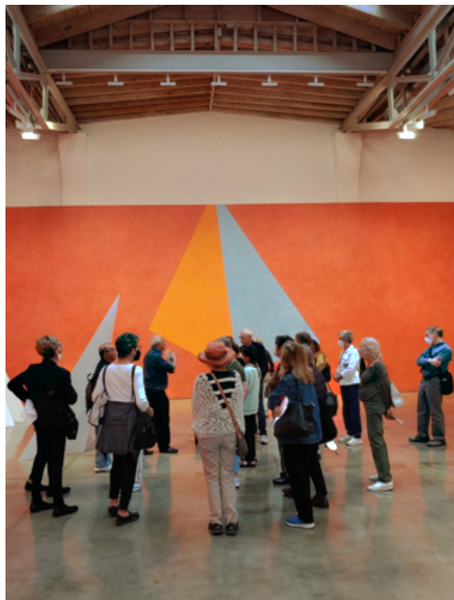
The Sol DeWitt wall drawing at the Paula Cooper Gallery.

Many of us joined together for lunch after the tour which gave us the opportunity to relax and chat about what we had just seen. We agreed that it was another educational Quest experience!