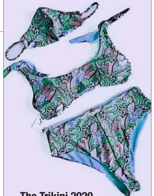
The Trikini 2020